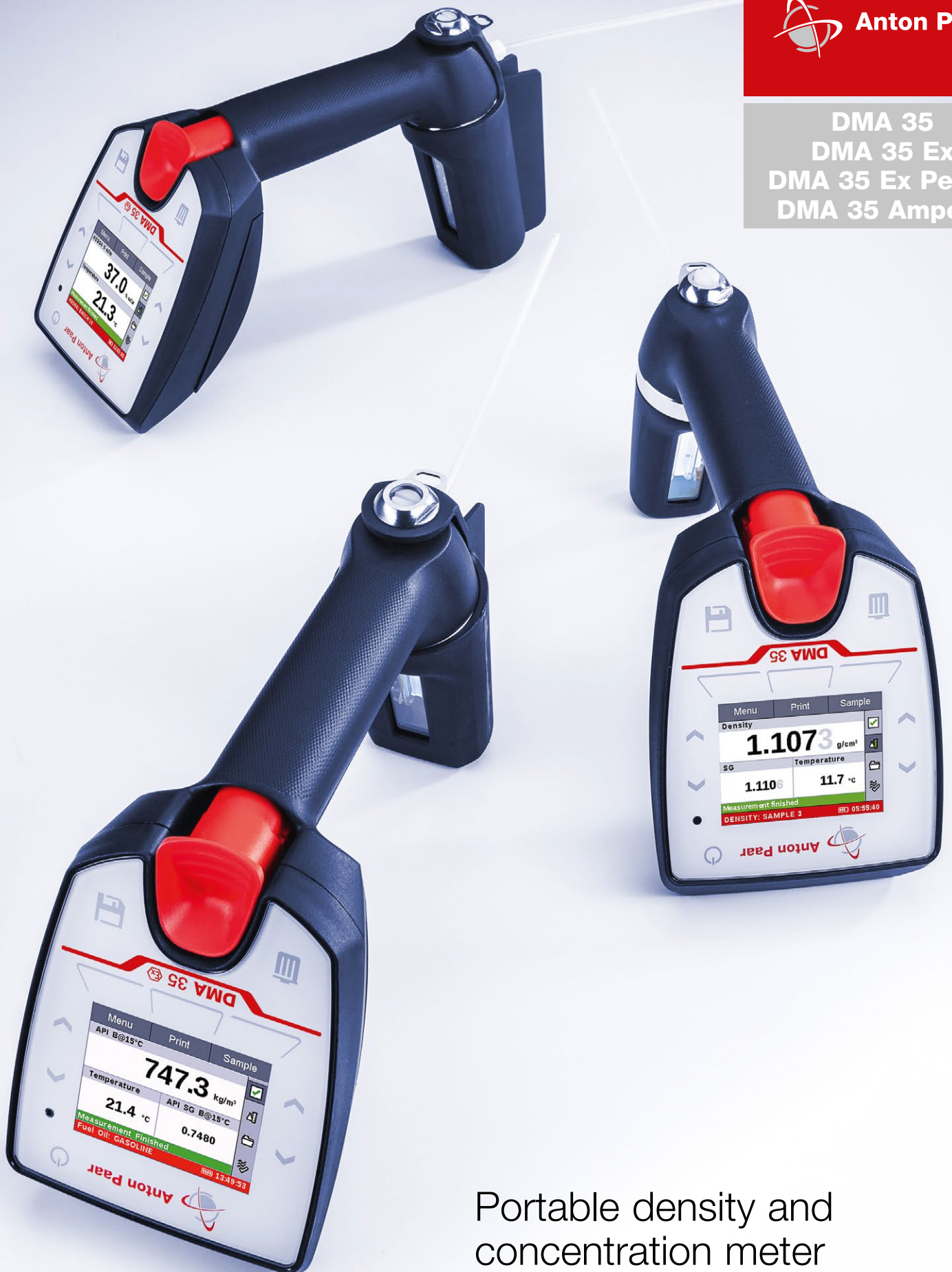
Portable density and concentration meter

DMA 35 DMA 35 Ex DMA 35 Ex Petrol DMA 35 Ampere